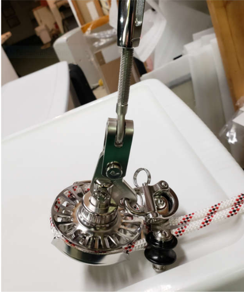
Bartels Endless Furler. View #1