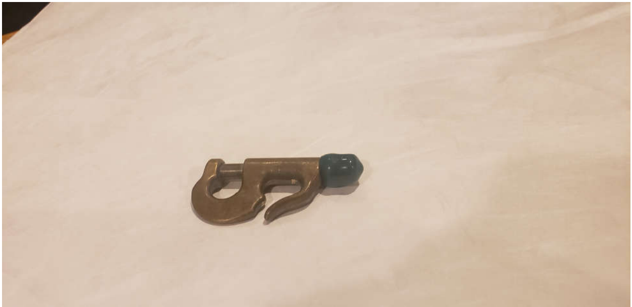
Thread Protectors Installed on Hanks