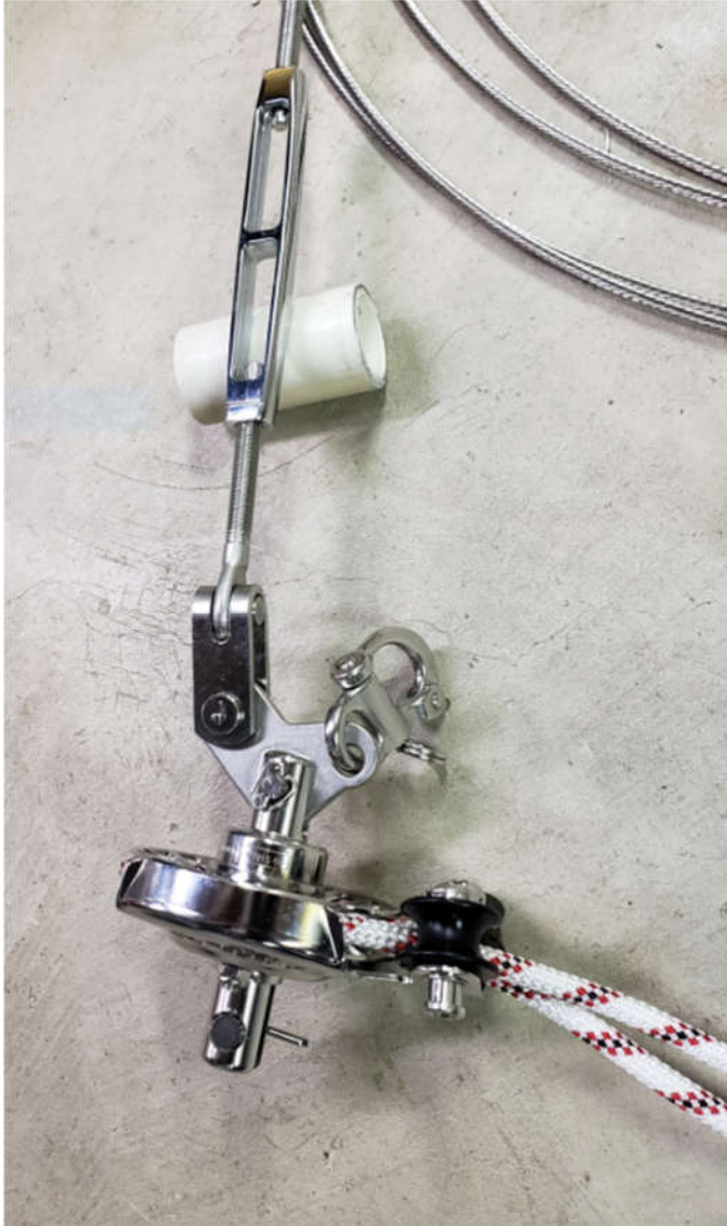
Bartels Endless Furler. View #2