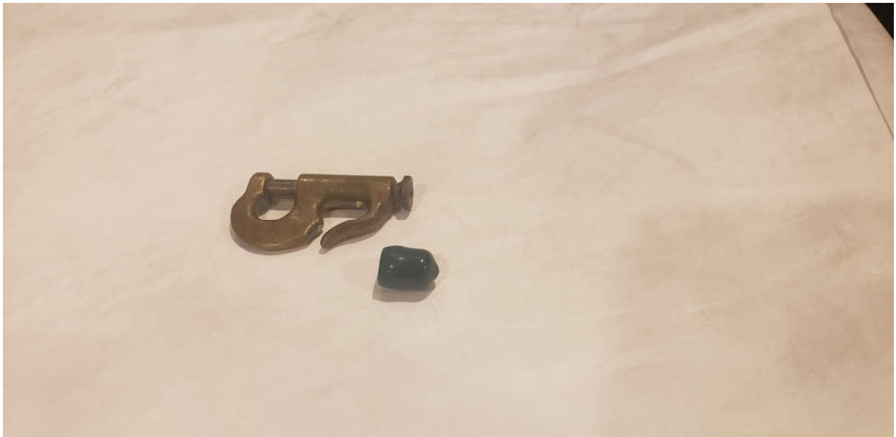
Hanks and Thread Protectors