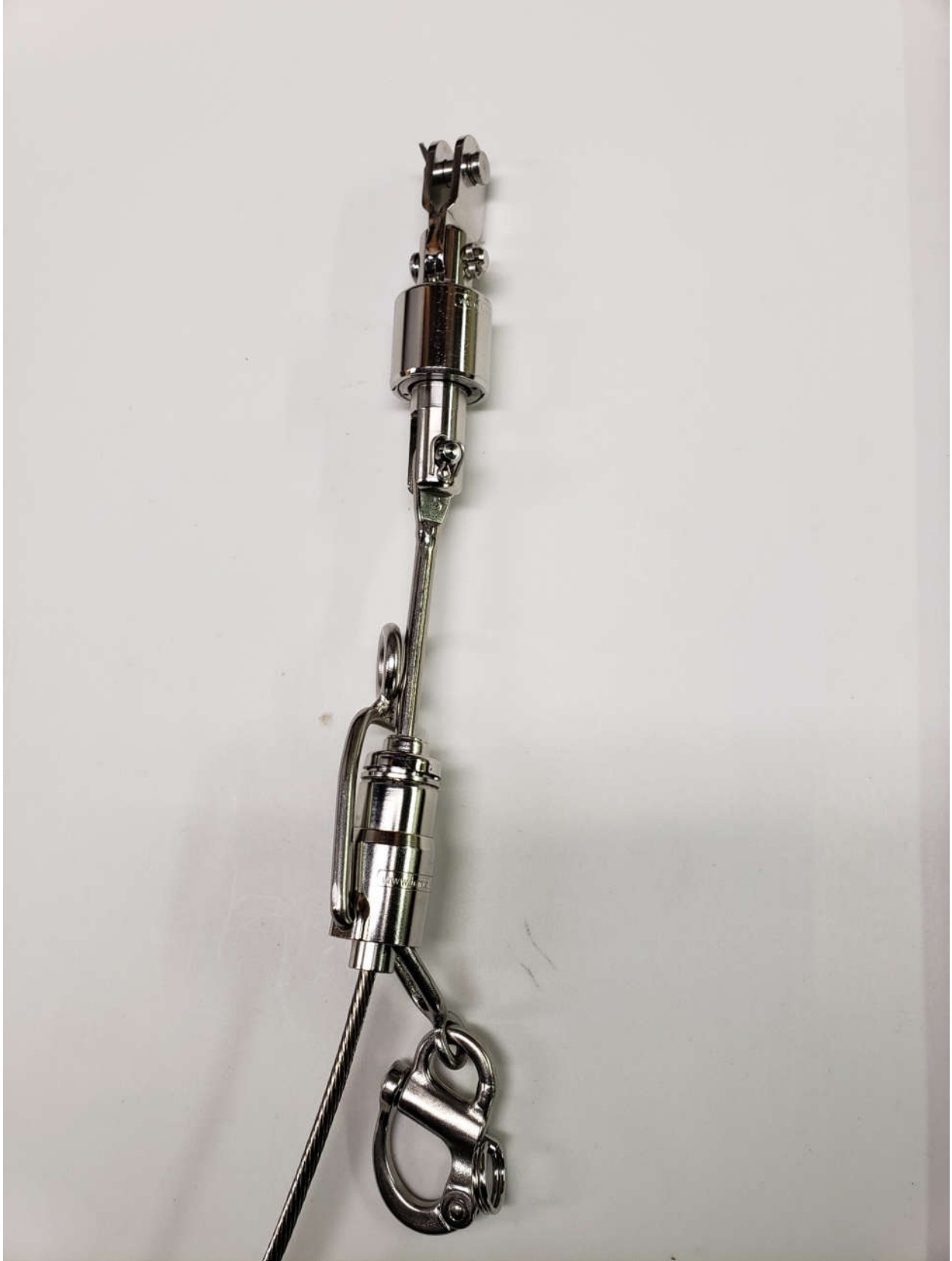
Bartels Forestay Swivel, Above and Headsail Swivel, Below